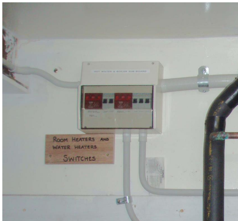
The white electrical sub-board for turning on the Off-Peak Hot water

Please do not touch anything else in this plant room.